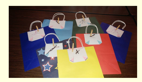
If you are donating diapers - we need sizes 4,5,6!!!

In December we offered bags with gift tags for our family siblings and all were picked up by church families from Northminster Presbyterian Church. They were filled with small treats for the siblings and board members got adorable huge teddy bears that all the babies loved! All families were surprised and very grateful. One mom even brought some sweet bread for the volunteers.